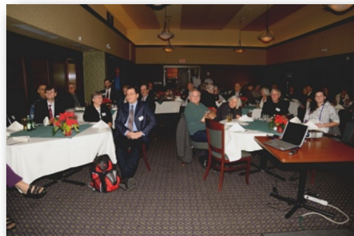
Last AGM in 2009