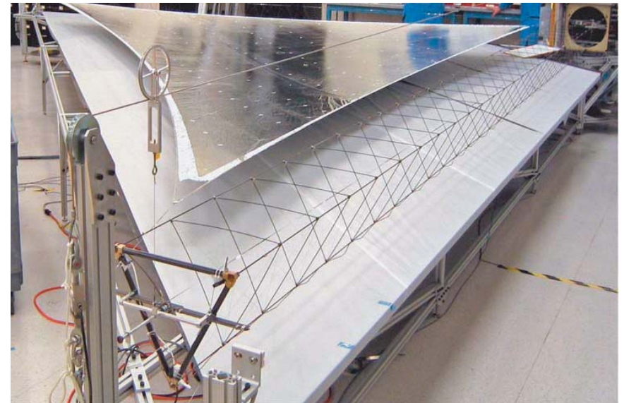
SAILMAST is the thin triangular truss in front of the picture. It is attached to a section of a silver foil solar sail section shown here in a laboratory test. The mast in the picture is 2m (6 ft) long. The Space Technology 8 mission will test the SAILMAST, which is 20 times longer.

Enter SAILMAST, a program to build and test-fly a mast light enough for future solar sails. With support from NASA's In-Space Propulsion Program to mature the technology and perform ground demonstrator tests, SAILMAST's engineers were ready to produce a truss suitable for validation in space that's 40 meters long, yet weighs only 1.4 kilograms!