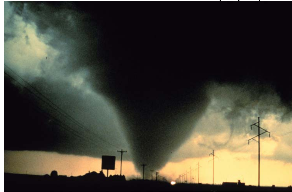
This severe tornado hit south of Dimmitt, Texas, on June 2, 1995

This article was provided by the Jet Propulsion Laboratory, California Institute of Technology, under a contract with the National Aeronautics and Space Administration.